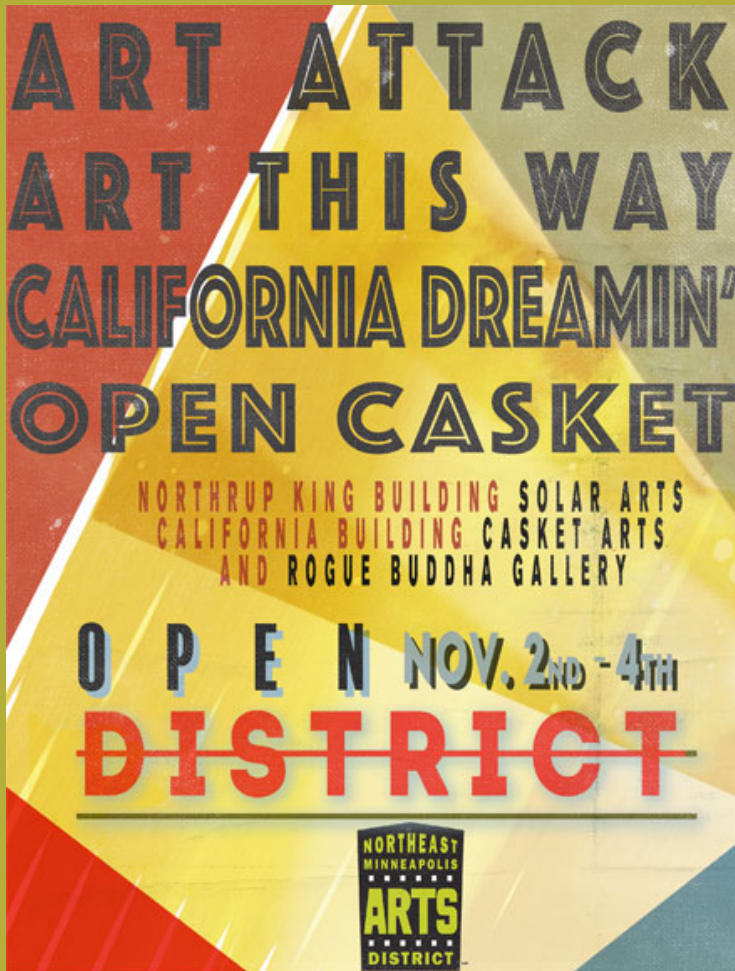
Open District featuring five Art Buildings in the Northeast Minneapolis Arts District