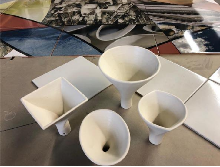
3-D printing by Brian Bolden

Amy Baur and Brian Bolden, inplain sight art studio , have done public art projects over the past 20 years; printing photography onto ceramics and glass. Recently they added 3D printing to their tool library and process. Their latest piece uses porcelain 3D forms glazed with smooth satin white. Baur said, "We have designed a simple mounting system with 3D printed nylon creating an interface between the porcelain and the wall. Nylon has the same molecular properties as silk and can be dyed using acid based dyes creating amazing translucent color.