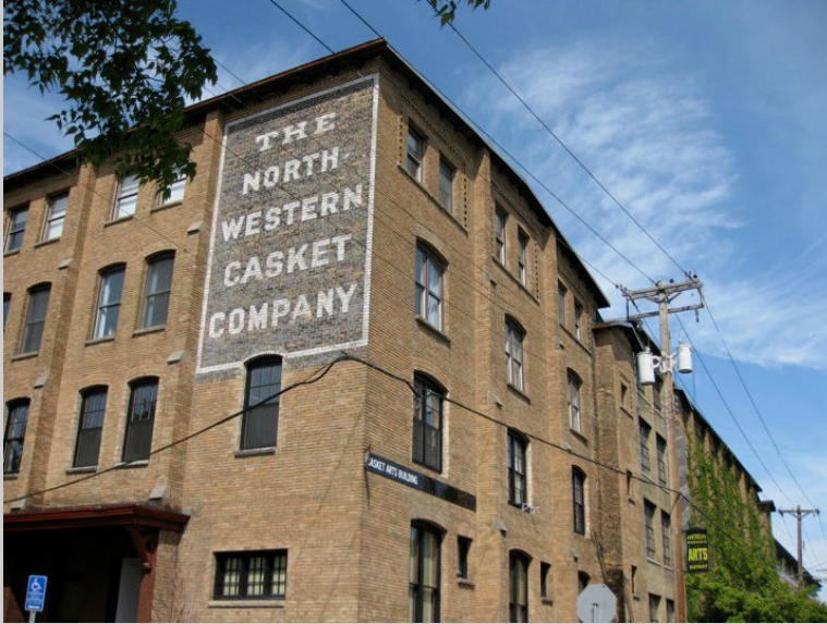
Casket Arts Building

WHAT'S NEXT? We encourage everyone committed to defining the needs of our creative culture and sustaining the vitality of the Arts District to form working groups now and develop a plan of action. Send your ideas and comments to info@northeastminneapolisartsdistrict.org by August 10 . The Board of Directors will review proposals and publish a report on the next steps forward.