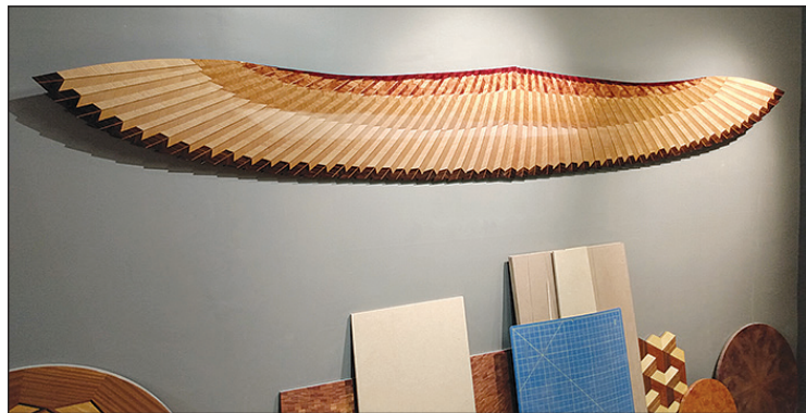
Shown in the context of Thomas Schrunk’s simple tools and materials, The Wing on the wall is his newest piece.