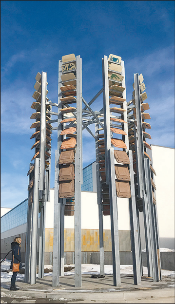
Collection Point, at left, integrates art sourced from the Northeast community, reproduced on the undersides of cast concrete lids. Photo at right is looking up from inside the new installation near the Northeast corner of 26th and University Avenue.