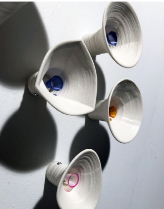
in plain sight art studio

with smooth satin white. Baur said, "We have designed a simple mounting system with 3D printed nylon creating a interface between the porcelain and the wall. Nylon has the same molecular properties as silk and can be dyed using acid based dyes creating amazing translucent color. The mounting system is becoming another aesthetic element to explore in our new work. As an assembled horizon our work transforms image to form, suggesting optimism and growth, part terrestrial and celestial." The piece, in which the forms will hang in relief off the top edge of a 20-ft. by 6-ft. custom image fused to tile, will be mostly completed and on view at Casket Arts Building Studio 121 during Art-A-Whirl.