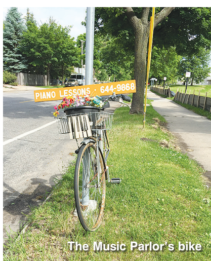
The Music Parlor's bike