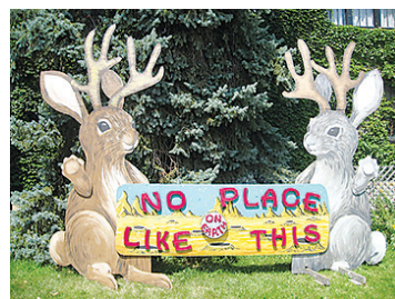
Jackalopes by Amy Toscani — Commenting on the NE Arts District?

But I was confused by the Arts District moniker. Finally, I asked "so where exactly is it?" I was looking for a strip of galleries to pop in for a moment, see local artists' work and meander on. I have learned that while there are a few well-curated shops in the area, window-shopping is not how the Arts District works. Engaging in art requires deliberate action.